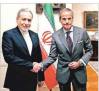
Iranian Foreign Minister Abbas Araghchi, left, shakes hands with International Atomic Energy Agency Director-General Rafael Mariano Grossi during their meeting in Geneva on Monday

US Secretary of State Marco Rubio told reporters he's "hopeful" Tehran and Washington can overcome years of tense confrontation and hostility and eventually broker an agreement. "It's been very difficult for anyone to do real deals with Iran because we're dealing with radical clerics who are making theological decisions, not geopolitical ones, but it's clear what happens. I hope it works out. We all have a vested interest," Rubio said.